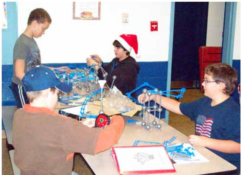
Participants are pictured enjoying building a ramp for marbles to run down!

You meet with them for one hour a week, on Wednesdays after school. If interested, please sign up in your guidance