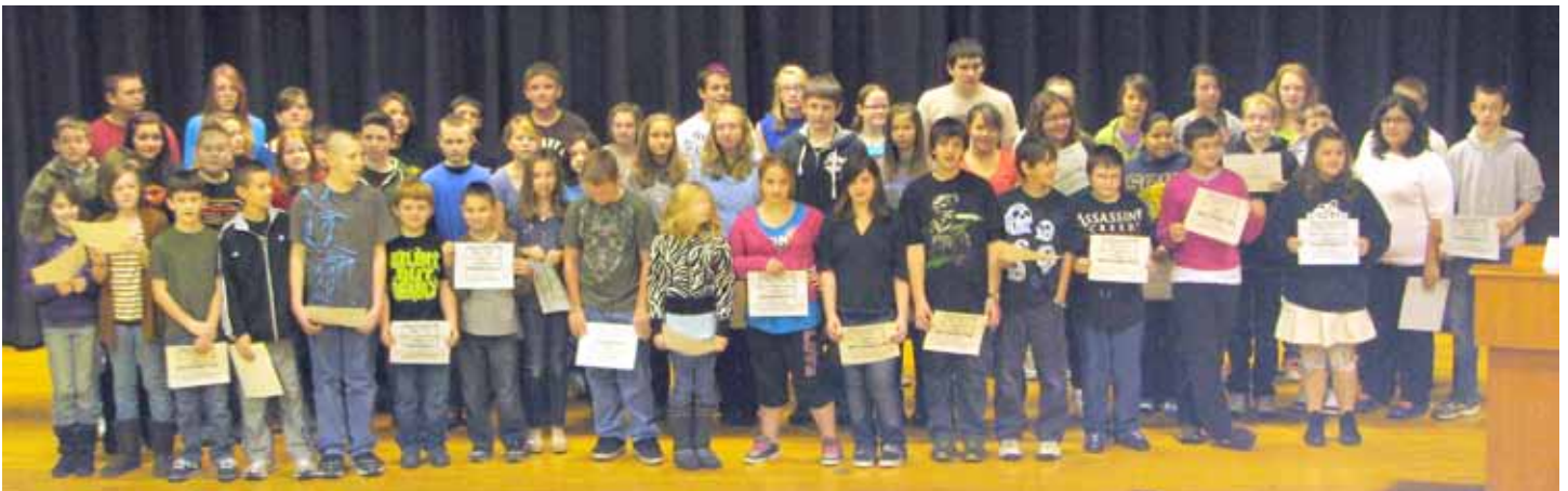
MIDDLE SCHOOL STUDENTS honored at the honors assembly are shown.