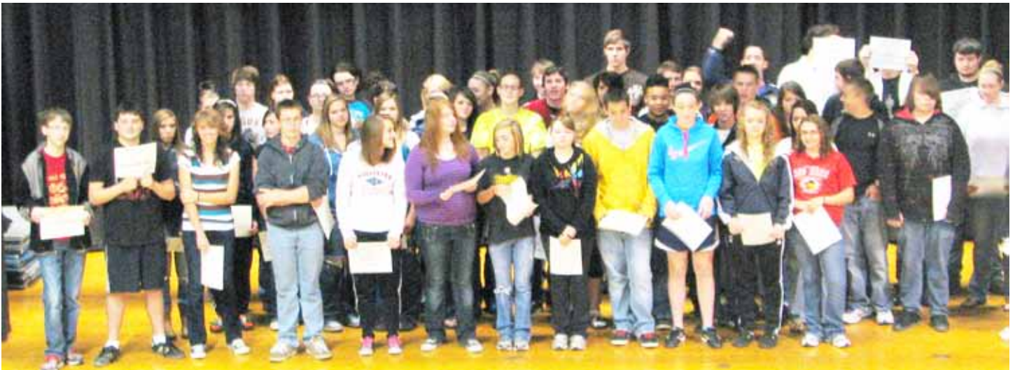
HIGH SCHOOL STUDENTS honored at the November 16 honors assembly are pictured.

stay in contact with teachers as issues and questions arise. Agenda use, homework completion, improved and focused study habits, class participation, and seeking assistance when needed are all emphasized within the walls of the school. Their emphasis outside these walls is necessary as well. A commitment from all involved is required to accomplish the ultimate goal that is so critical, the goal of student achievement.