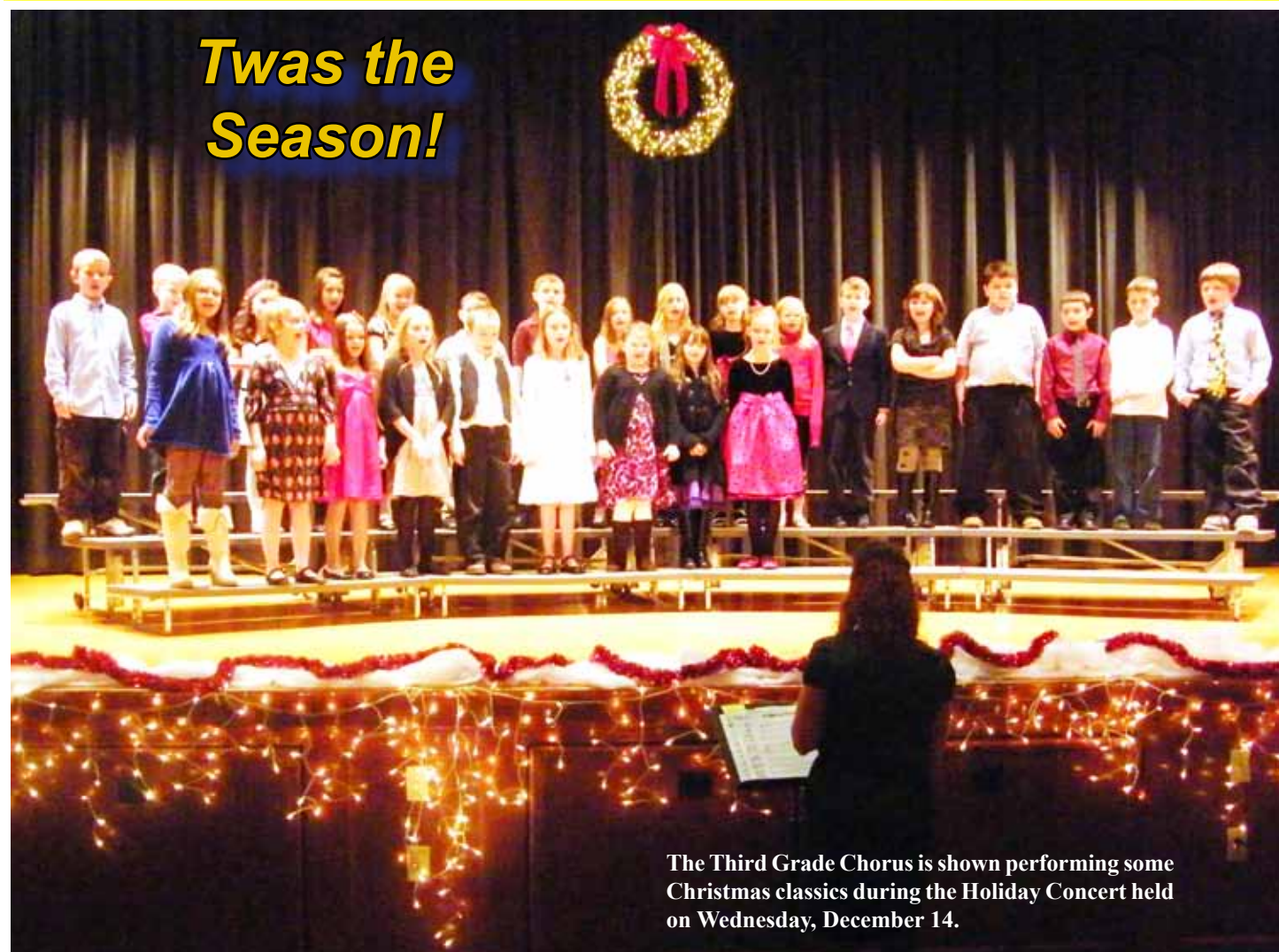
The Third Grade Chorus is shown performing some Christmas classics during the Holiday Concert held on Wednesday, December 14.