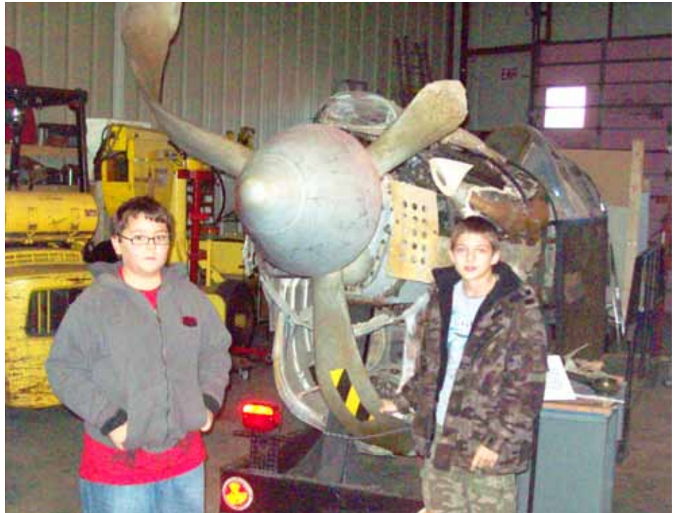
21st Century After School Program participants are shown in front of an original wrecked military plane at the Curtiss Museum.