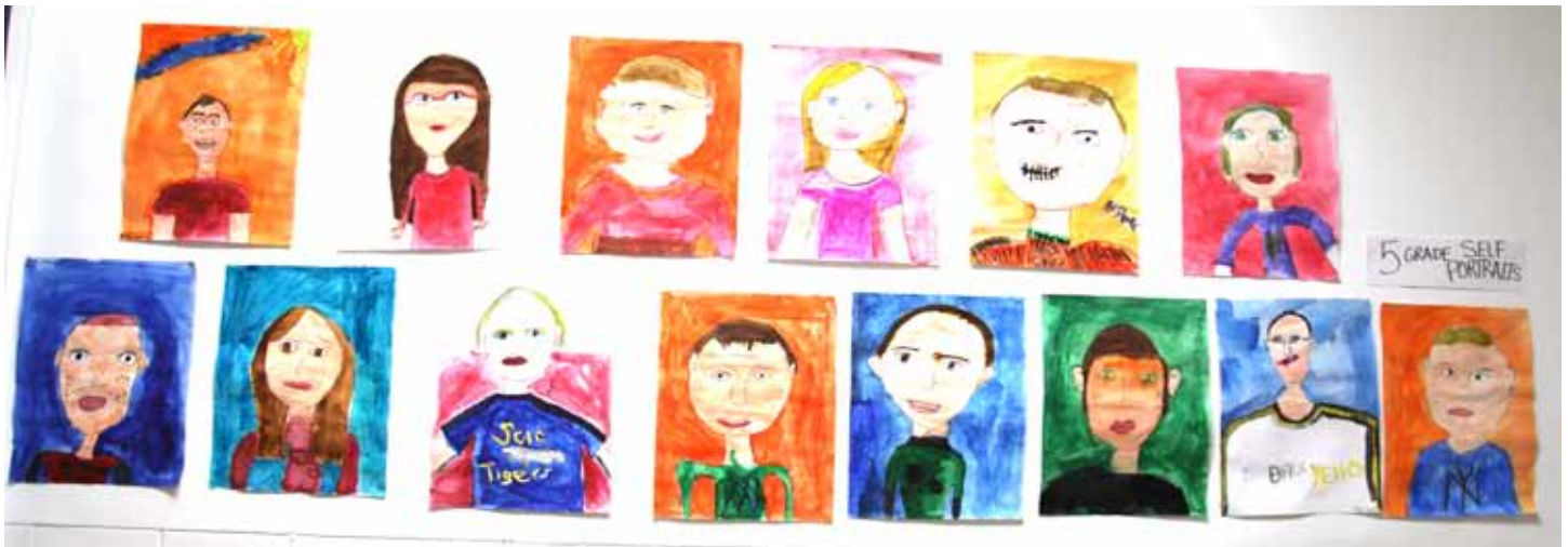
Some fifth grade self portraits are shown above.