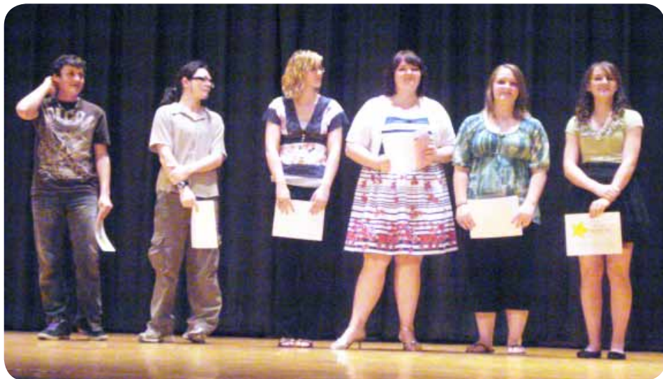
BELOW - The performers from the ages 15-17 group.