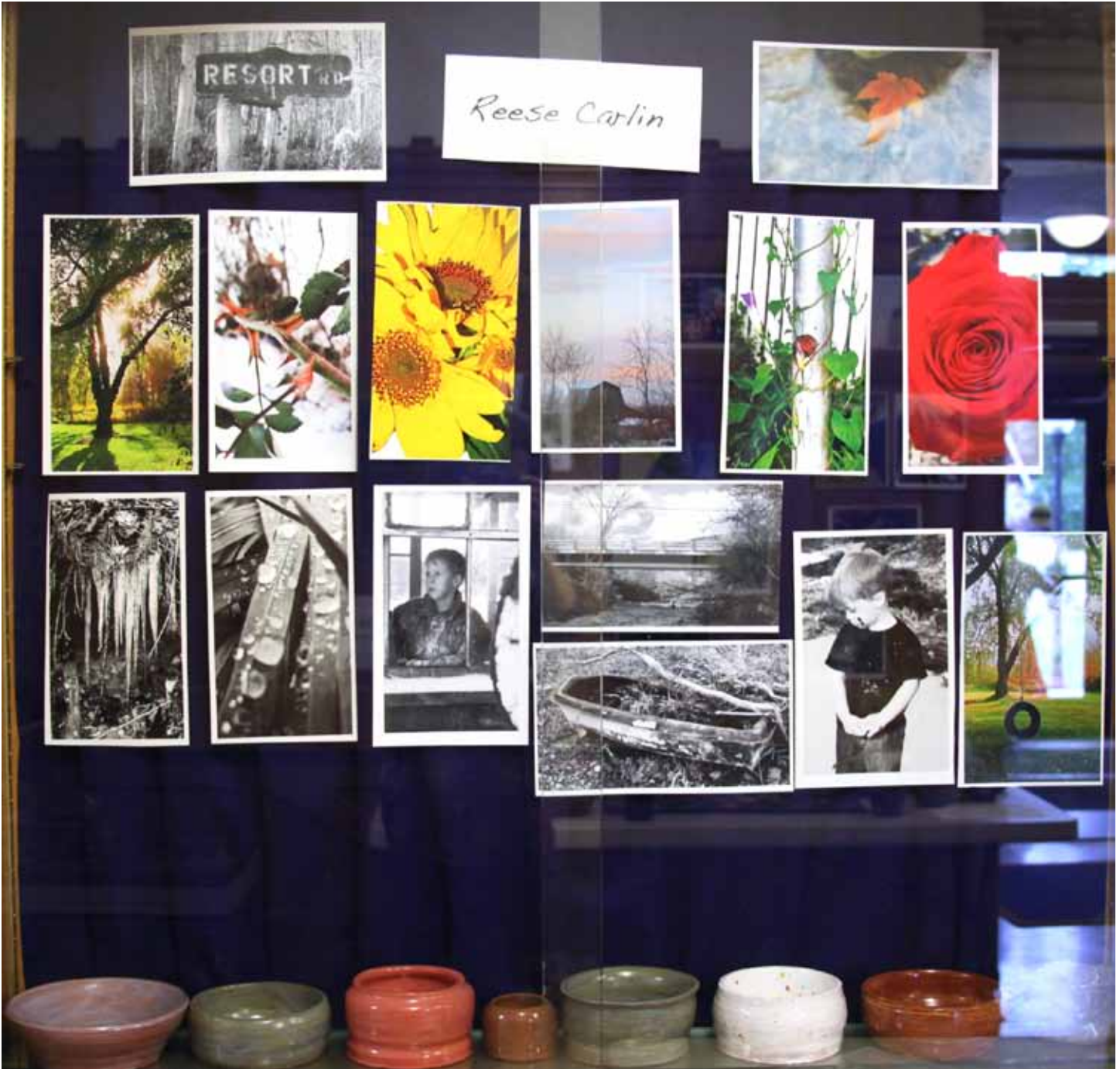
Some of Reese Carlin's work is shown above.