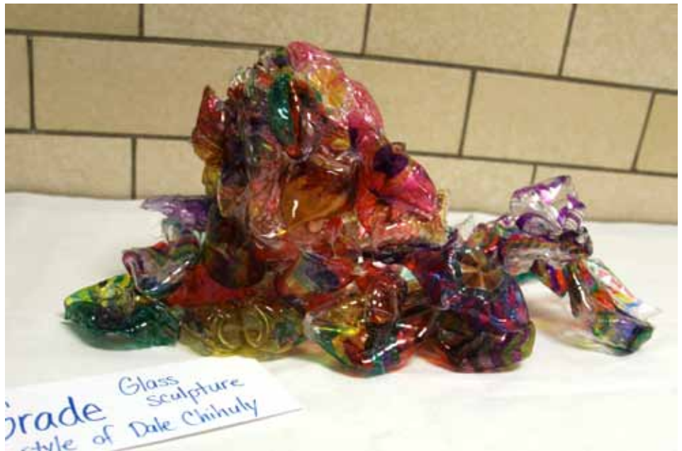
A glass sculpture created by the sixth grade as a class project.