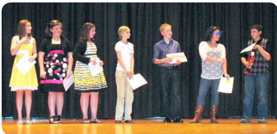
IN TOP PHOTO - The performers from the ages 8-10 group.