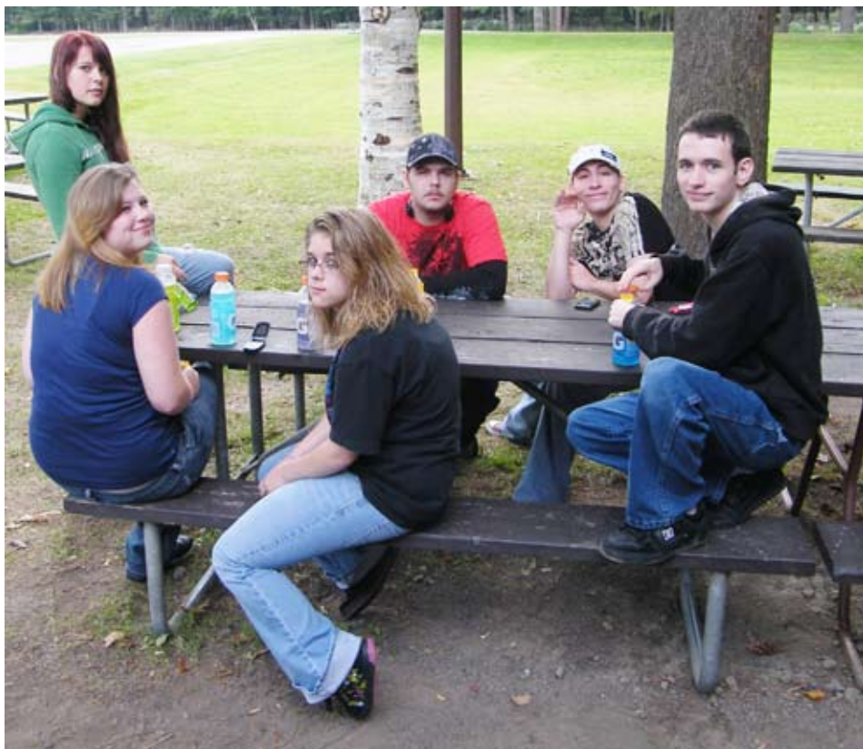
ABOVE & BELOW - Seniors are shown relaxing at their picnic at Letchworth State Park. See group photo on page 16.