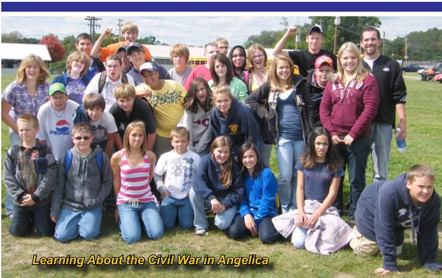
Learning About the Civil War in Angelica