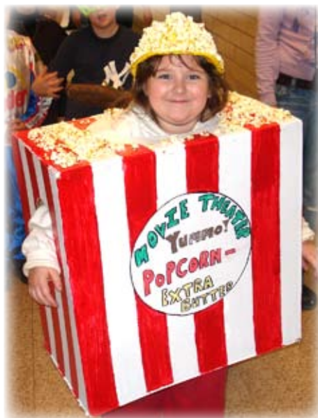
Randi came as a popular theater treat.